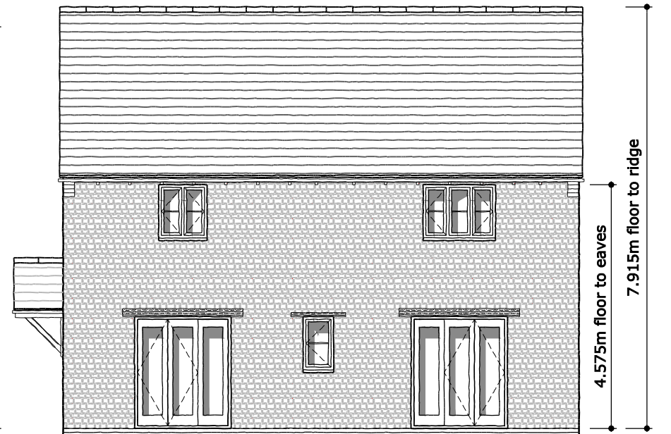
SIDE ELEVATION (PLOT 4)