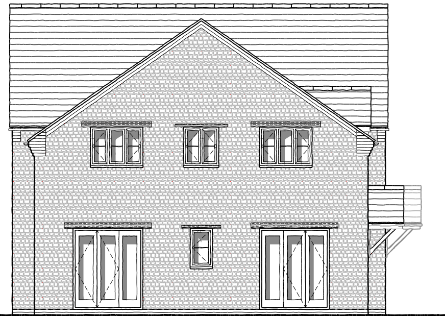
SIDE ELEVATION (PLOT 3)